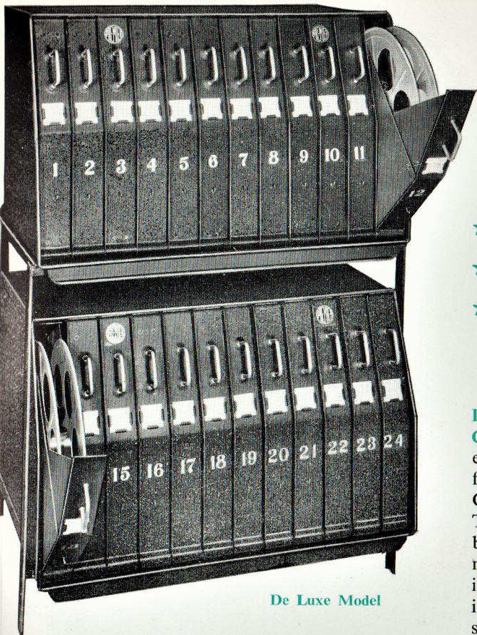
De Luxe Model

the illustration shows each spool is contained in a separate holder. This holder is hinged at the bottom, and is so pivoted that when the spool is put in the compartment, and is released, the compartment automatically closes.